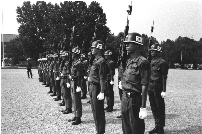
South Korean soldiers.