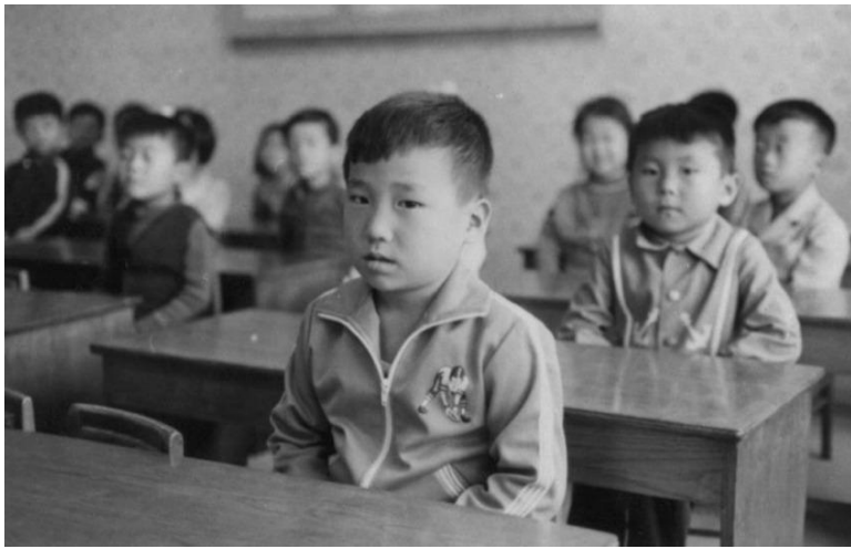
Children in North Korea.