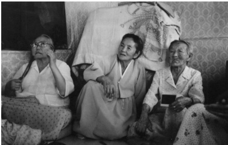
Elders in South Korea.