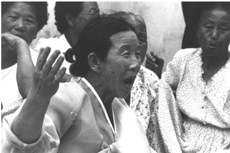
Korean Woman in Homes Apart