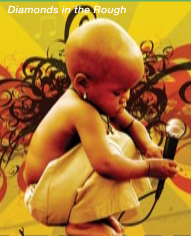
Diamonds in the Rough