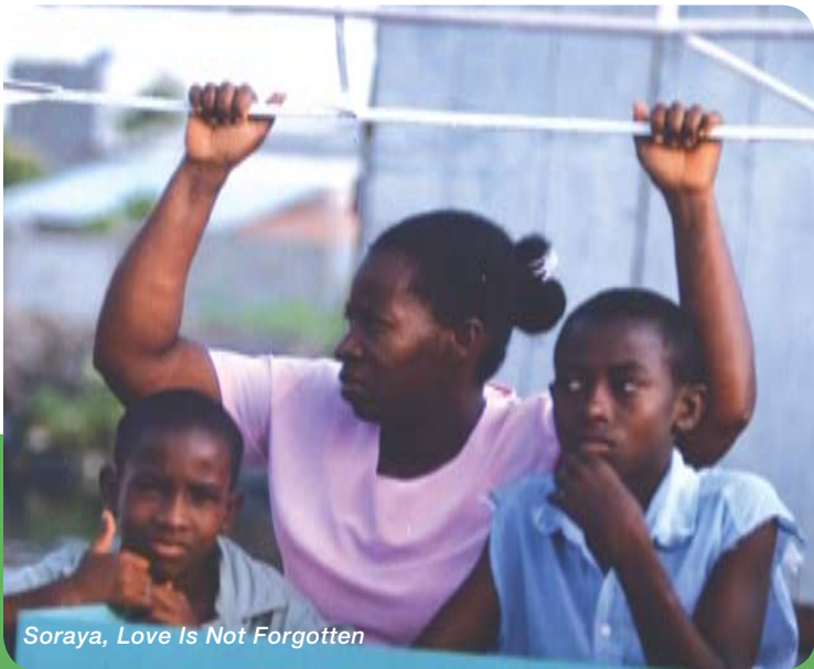
Soraya, Love Is Not Forgotten

Our mission is to foster the creation, appreciation and dissemination of social issue media made by or about people of color. The importance of the media promoted by the organization is its ability to effect social change, to encourage people to think critically about their lives and the lives of others, and to propel people into action. Today, TWN carries on the progressive vision of its founders, and remains the oldest media arts organization in the United States devoted to filmmakers of color and their global constituencies.