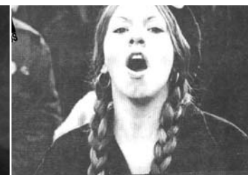
Ritual Rhythms, Cuban Roots, E Mihna Cara